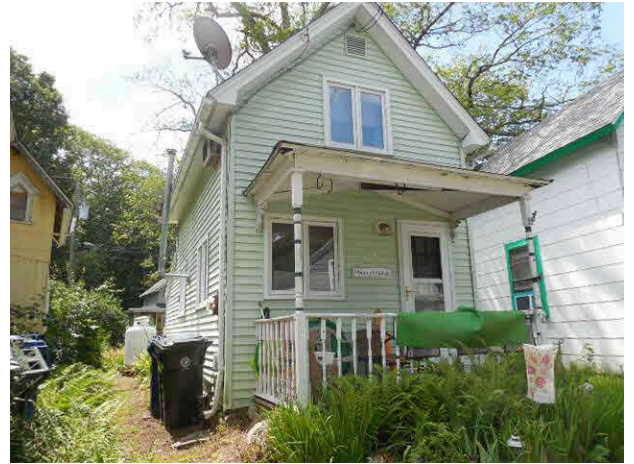
( https://images.vgsi.com/photos/windhamctPhotos/A00\00\63\93.jpg )